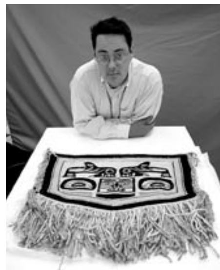
July 18, 2002