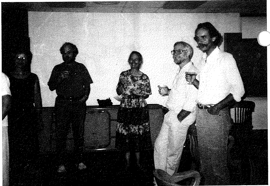
Folklorists find a moment of relaxation at St. Meinrad's during the two-day retreat.

We began by identifying the main areas of concern, assessing their implications, and working towards